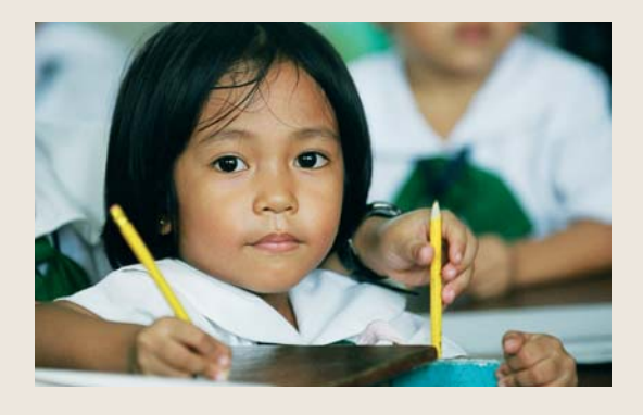
SOS Nursery School Cebu, Philippines