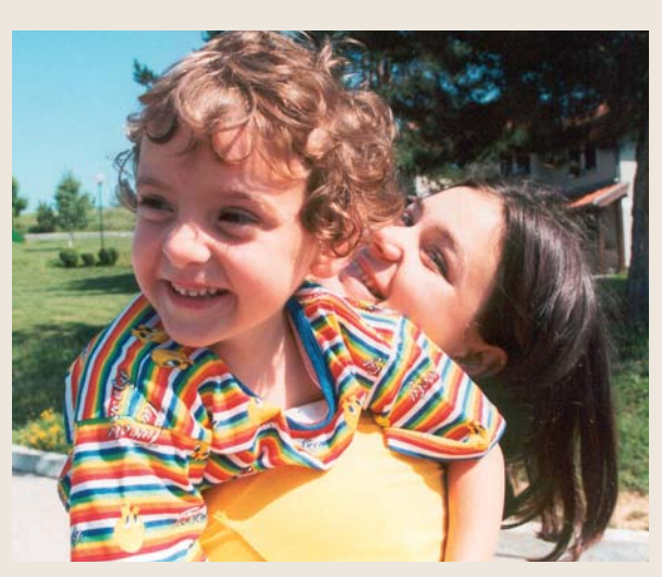
SOS Children's Village Trjavna, Bulgaria (Mauro Minozzi)