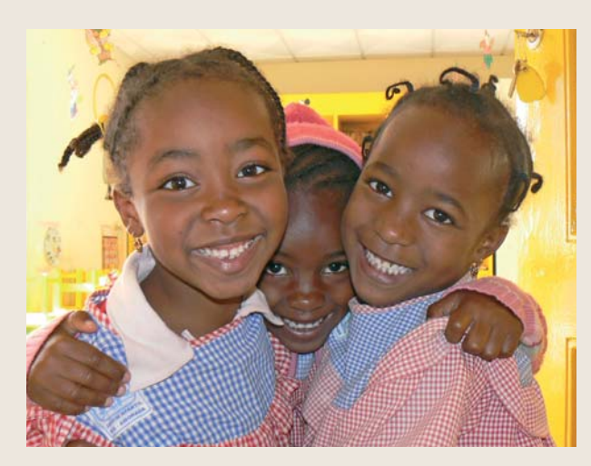
SOS Nursery School Assomada, Cape Verde

You can continue to help SOS Children by leaving a gift in your will. This is a wonderful, practical way to carry on supporting the children and villages you care about. For more information, please give us a call: 01223 365589 .