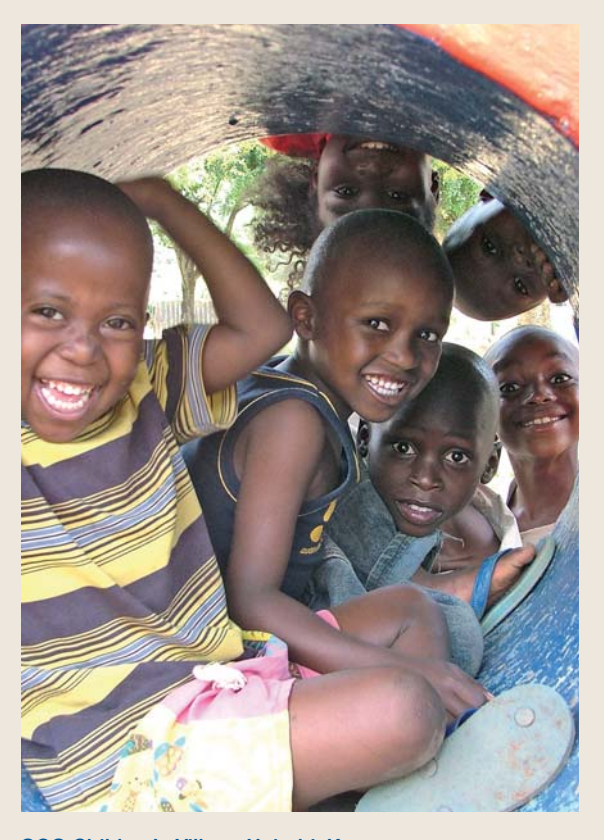
SOS Children's Village Nairobi, Kenya