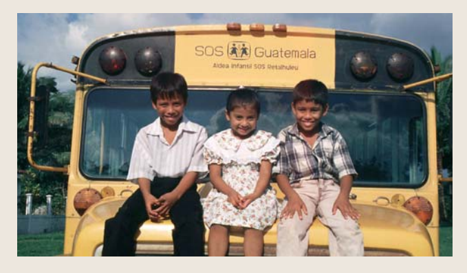
SOS Children's Village Retalhuleu, Guatemala

Please bear in mind that we don't put pressure on our children to write back to their sponsors. Some children may not be able to write back to you, as a number of children are behind in their education when they join us or because letter writing is not part of the culture in certain countries. Many of the older children, especially if they are learning English as a second language, do write to their sponsors, but it's entirely their decision.